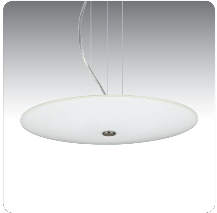
RENPRO SHOWN IN WHITE SPARKLE

UL or ETL Listed. Suitable for Damp Locations (interior use only).